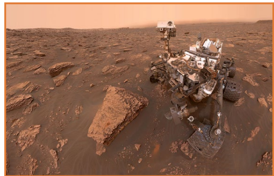
A self-portrait taken by NASA's Curiosity rover.

radiation – Energy emitted by the Sun, some of which is dangerous to humans when not absorbed by the atmosphere of a planet.